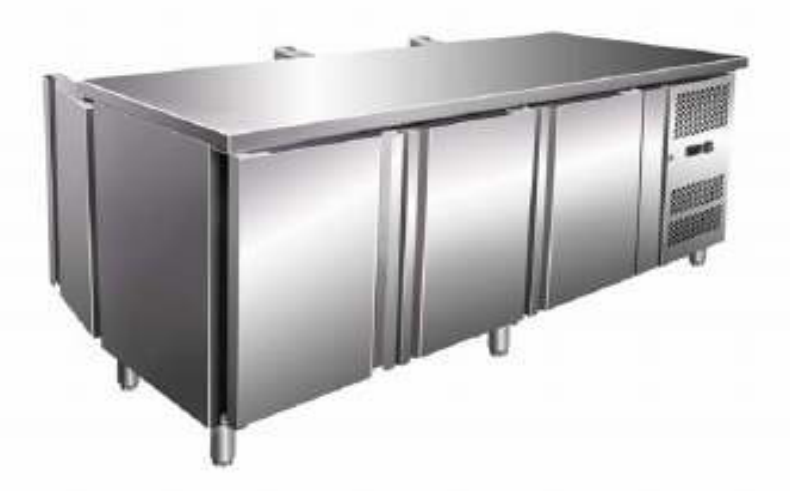
C-GN3100TN / C-PA3100TN